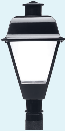
CLOSED TRADITIONAL LED