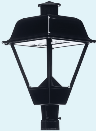
OPEN TRADITIONAL LED (Meets Dark Sky Criteria)